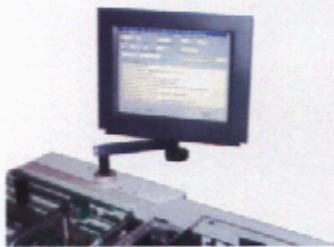
438 Advanced Touch Screen

With the added features of up to twelve stations of intelligent selection, dual metering with postage weight calculation and divert, envelope suppression and sequential start-up and shut down, the 438 converts a standard inserter into an intelligent system. The 438 also operates off-line by simply purchasing the off-line conveyor option.