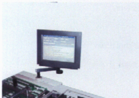
438 Advanced Touch Screen

With the added features of up to twelve stations of intelligent selection, dual metering with postage weight calculation and divert, envelope suppression and sequential start-up and shut down, the 438V can convert a standard inserter into an intelligent system. The 438V also operates off-line by simply purchasing the off-line conveyor option.