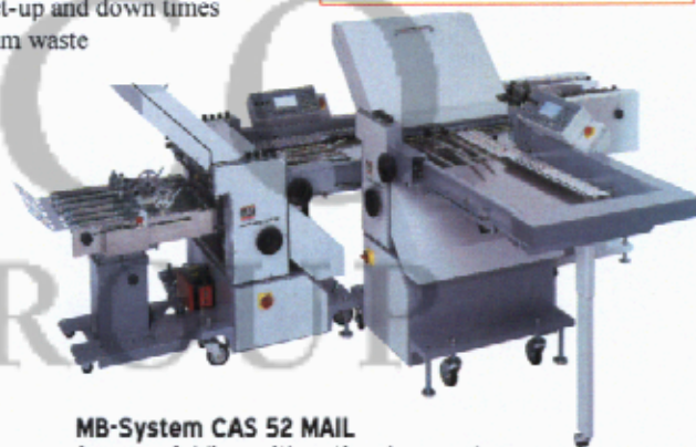
MB-System CAS 52 MAIL for crossfolding with optional separator sheet feeding